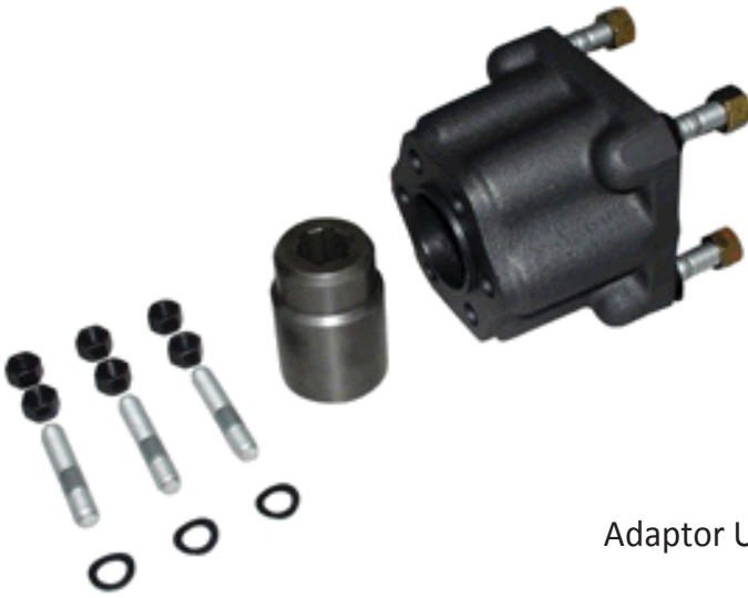
Adaptor UNI PTO (3 HOLES) / ISO (4 HOLES) PUMP